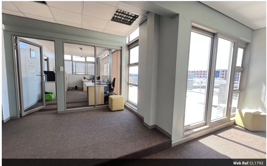
Web Ref CL1793

SAPROPERTY.COM House, 9 Boundary Road, Waterford Place, Century City, Cape Town