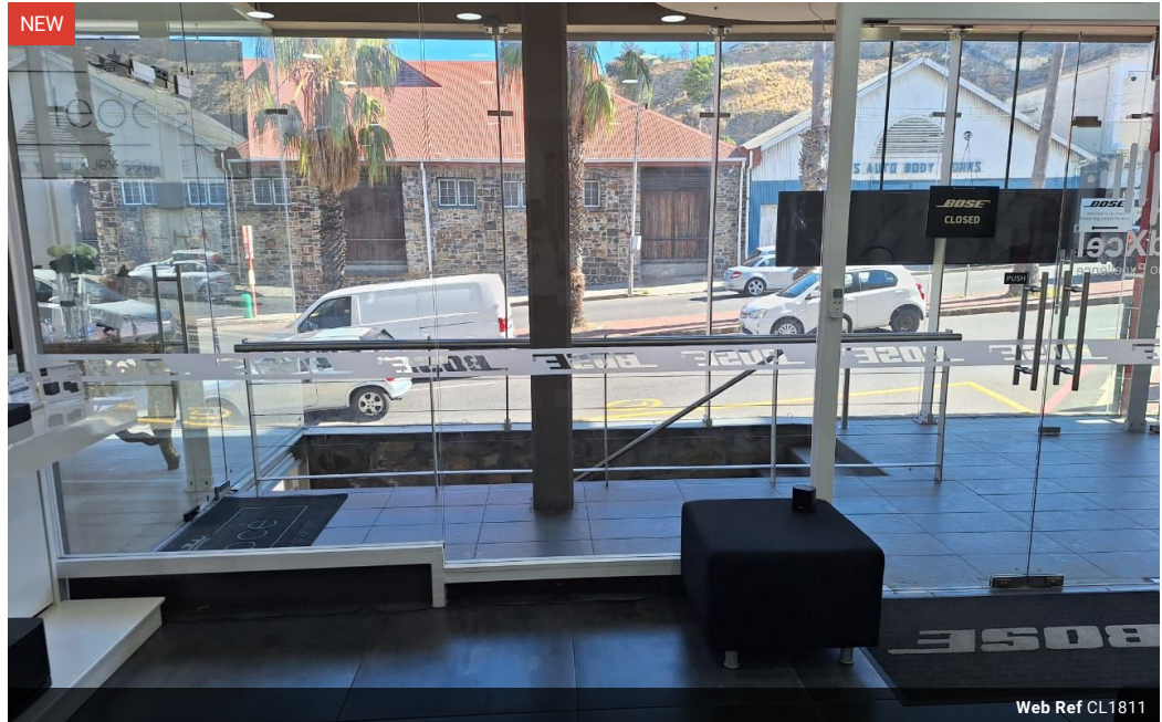
Web Ref CL1811

SAPROPERTY.COM House, 9 Boundary Road, Waterford Place, Century City, Cape Town