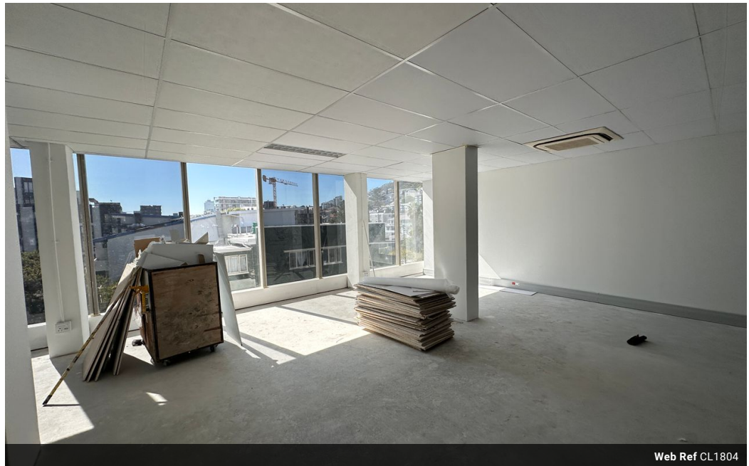
Web Ref CL1804

SAPROPERTY.COM House, 9 Boundary Road, Waterford Place, Century City, Cape Town