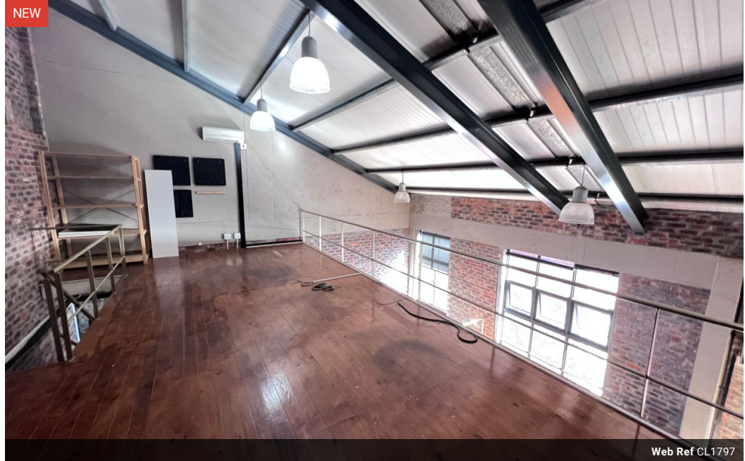
Web Ref CL1797

SAPROPERTY.COM House, 9 Boundary Road, Waterford Place, Century City, Cape Town