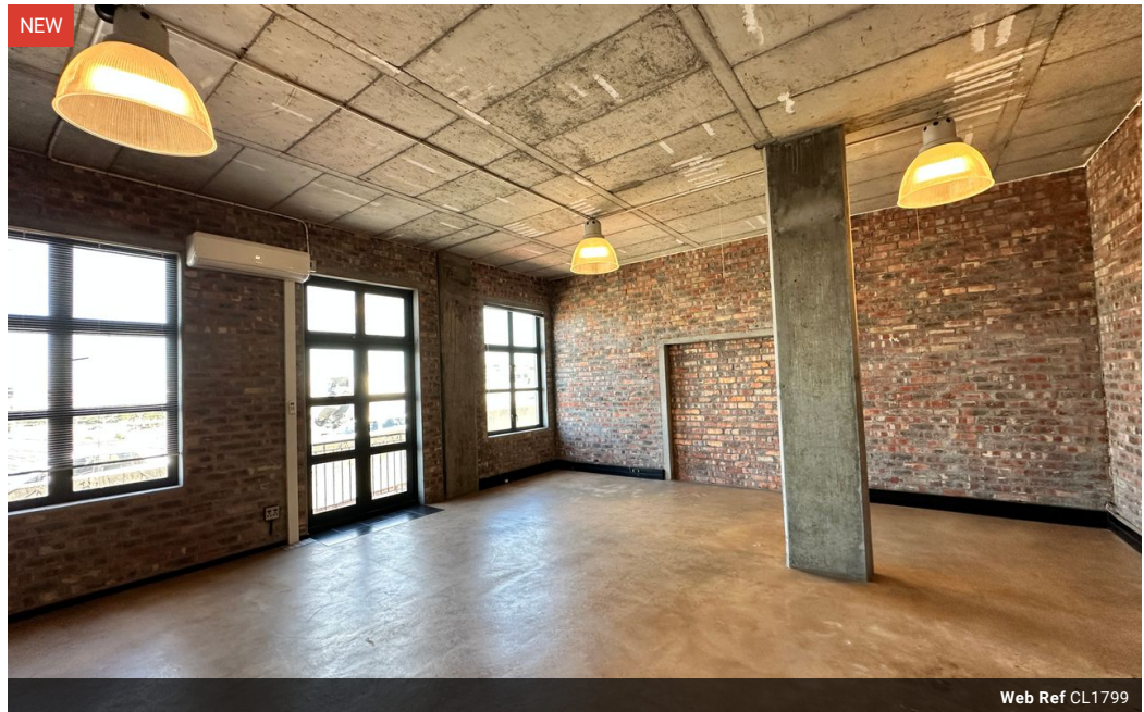
Web Ref CL1799

SAPROPERTY.COM House, 9 Boundary Road, Waterford Place, Century City, Cape Town