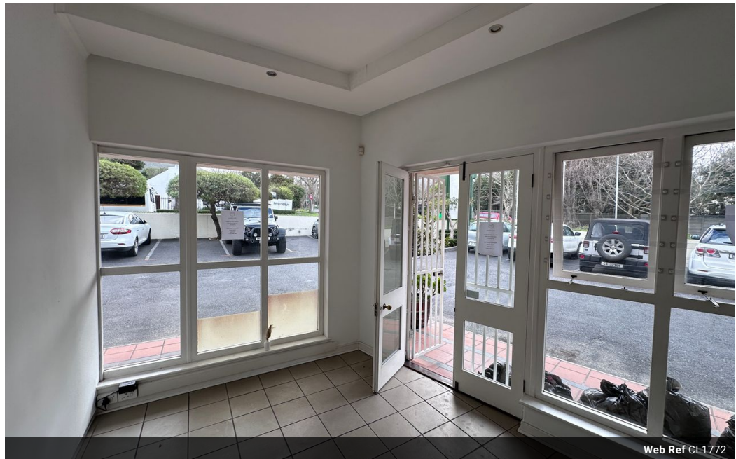
Web Ref CL1772

SAPROPERTY.COM House, 9 Boundary Road, Waterford Place, Century City, Cape Town