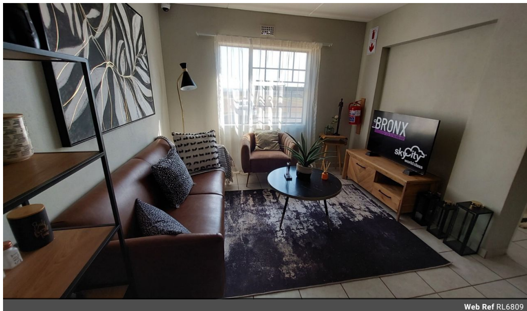
Web Ref RL6809

SAPROPERTY.COM House, 9 Boundary Road, Waterford Place, Century City, Cape Town