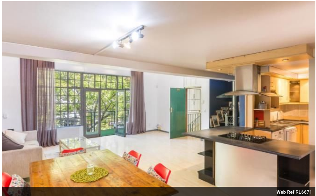
Web Ref RL6671

SAPROPERTY.COM House, 9 Boundary Road, Waterford Place, Century City, Cape Town