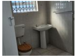
Web Ref RL6344